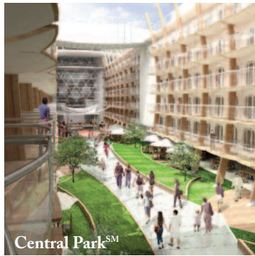
Central Park SM

Spend your afternoons strolling through Central Park SM or riding the Carousel on the Boardwalk. SM Then, at night, visit the AquaTheater to watch a mesmerizing water show or enjoy dinner with friends at a café on the Royal Promenade. And that's just the beginning!