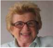
DR. RUTH WESTHEIMER 13 July